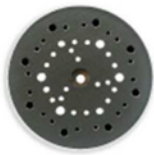
8000MAX-750 48621940 150 mm (6") hook-and-loop pad, vacuum