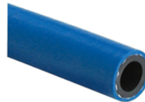
RH-8 92536036 PVC hose, 8 mm inside diameter, 30 m