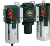
Filters, regulators, lubricators For the complete range, see our accessory catalogue.