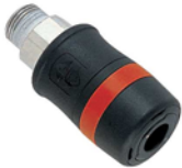
Quick Release Couplings For the complete range, see our accessory catalogue.