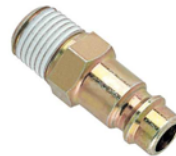
77NMC2 88104070 7N7/7S7 Series nipple, 1/4" male thread, 7.2 mm bore (EURO 7.2 - 7.4)