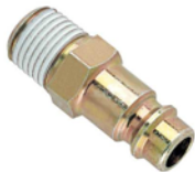
IB6NMC2 88103015 IBN/IBS Series nipple, 1/4" male thread, 6 mm bore (ISO6150B / MIL- C4109)